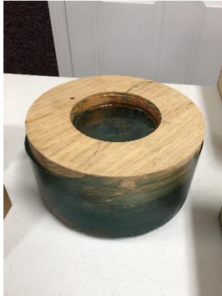
Gail Cone, bowl blank.