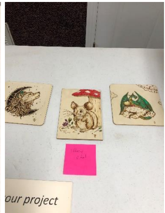
Tiffany Vital, Pyrography.