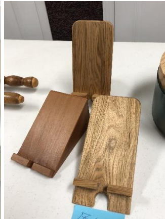
Basil Borkert, Telephone stands.