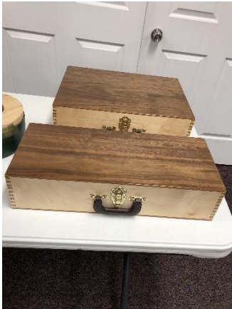
Jim Gott, tool chests.