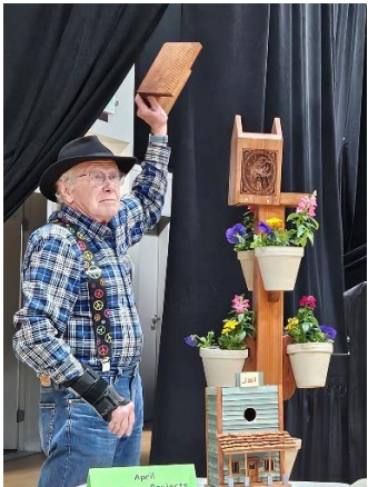
John Roberts Plant Stand