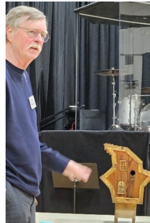
John Masters Bird House