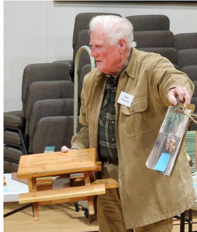
John Brideson Squirrel Picnic Table