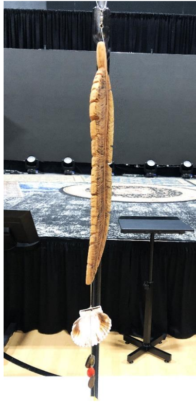
Micky Dupper Wind Chime