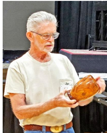
Gail Cone – Cherry Vase